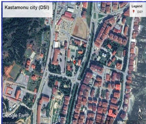
Fig. 1. Map shows the (DSI) kastamonu city.