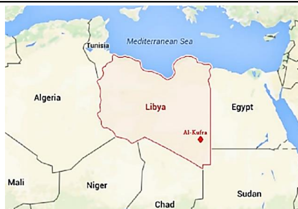
Figure 1: Map of Libya and the study area

Samples were collected from different farms at random; brought to the laboratory, fixed immediately in 4% formaldehyde. The algal were observed and identified till species level based on the existing literature (Desikachary, 1959; Guiry, 2013), and photographs were taken.